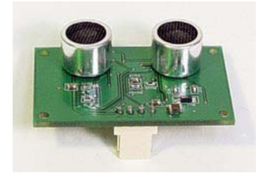
Figure III.1 DUR5200 Structure

Figure III.1 illustrates the structure of the board.